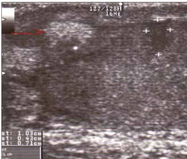
Fig. 2. Abscess of epididymis (marked by red arrow) and hypoechoic areas in testis (marked by +).

stage IIIB of AEO, initial conservative treatment was not effective so the patients underwent surgery.